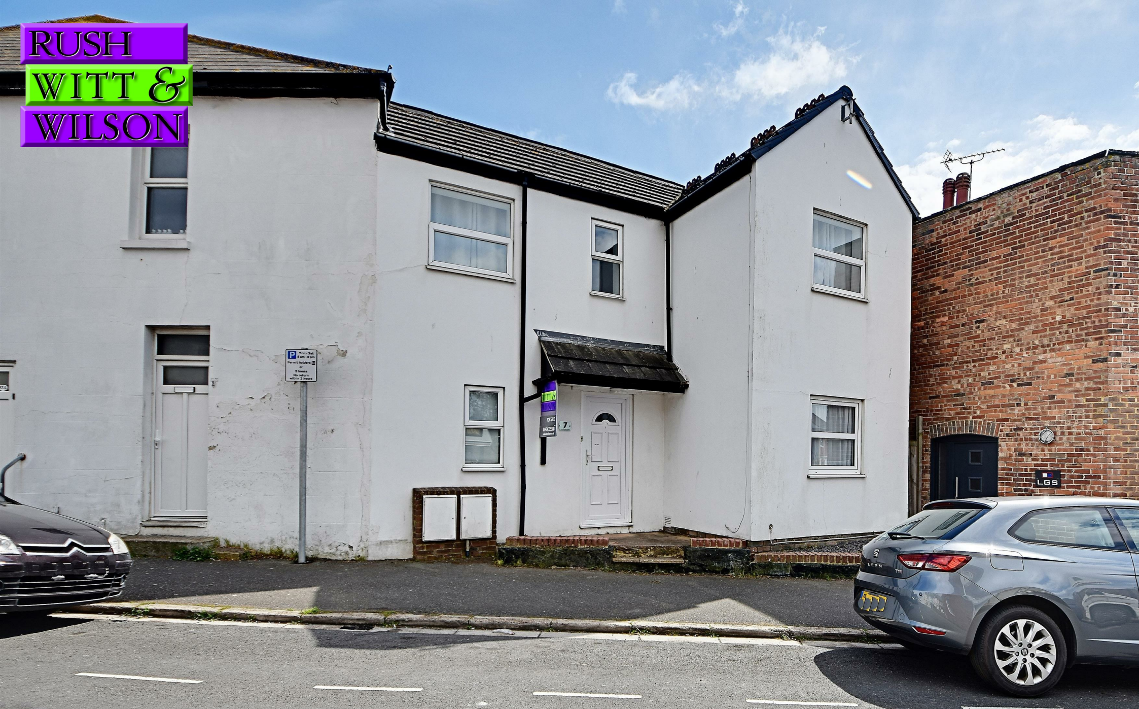
7 Victoria Road, Bexhill-On-Sea, East Sussex TN39 3PD Chain Free £244,000